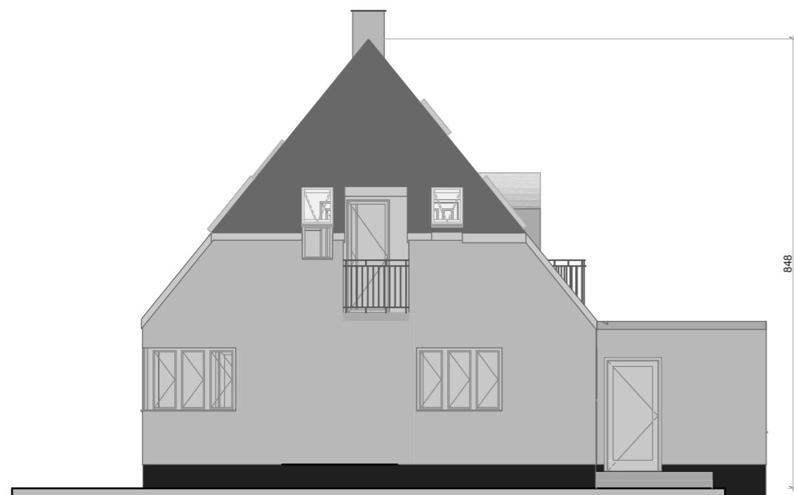
4 West Elevation 1:100